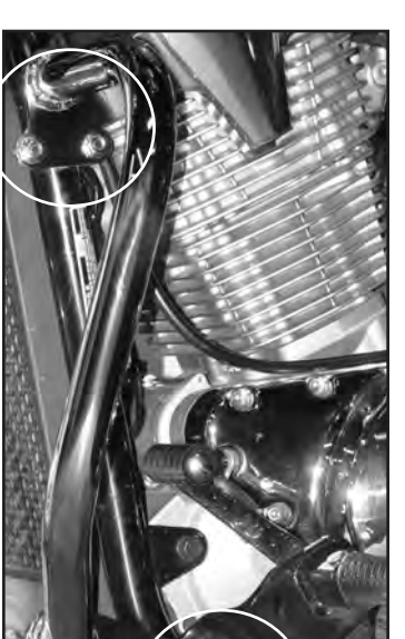
Figure 2, Right Side