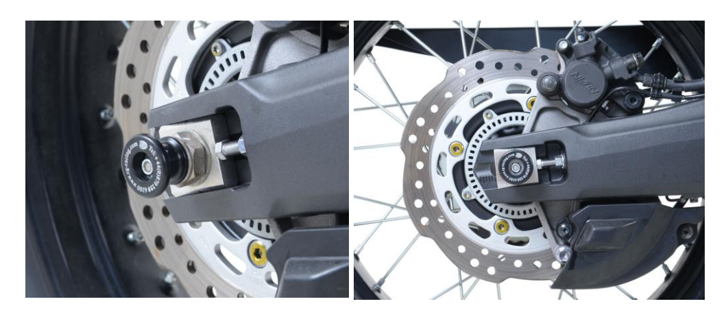
LE KIT CONTIENT LES ARTICLES EXPOSES CI-DESSOUS, VERIFIER QUE TOUTES LES PIECES SOIENT PRESENTES AVANT DE PROCEDER AU MONTAGE.

La façon dont le kit est emballé ne correspond pas forcément à la façon de monter les pièces sur la moto.